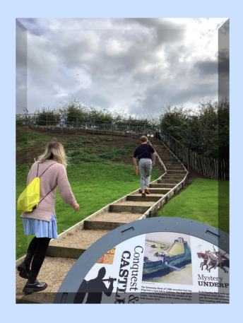
Cherry Class visited Oakham Castle this week.

In Science, some of the pupils have been exploring forces and magnets. This week, they were exploring the grounds to identify what is and isn't magnetic.